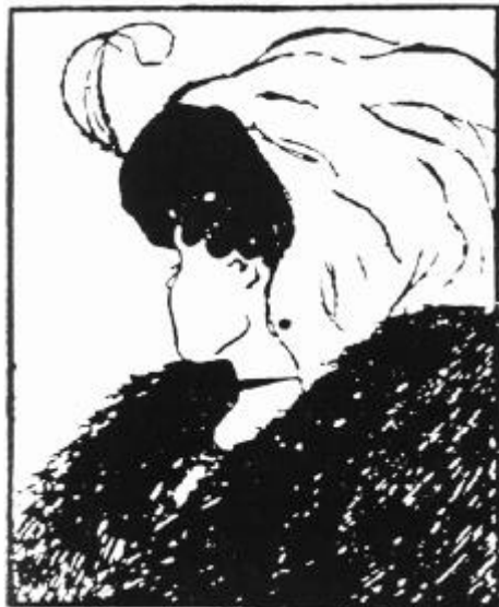
Boring women, Gestalt picture

The neuronal mechanism operating in the recognition of the Boring Gestalt picture is described by Bösel and Pöppel: